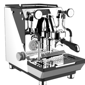
ONE 2B R-LFPP Dual