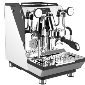
ONE 1B Dual